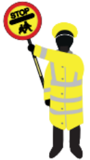
Figure C - Sign held up high - ready to cross pedestrians. Vehicles must stop unless unsafe to do so.