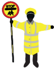
Figure D - Sign held up high - All drivers must stop

Please support your local School Crossing Patrol Service Find out more online - www.roadsafetygb.org.uk