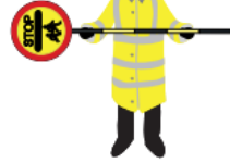
Figure B - Sign sideways - Barrier to prevent pedestrians crossing. Not ready to cross pedestrians