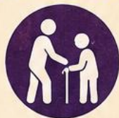
HELPING ELDERLY RESIDENTS