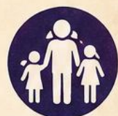
HELPING OUT WITH CHILDCARE