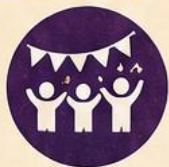
HOSTING COMMUNITY EVENTS